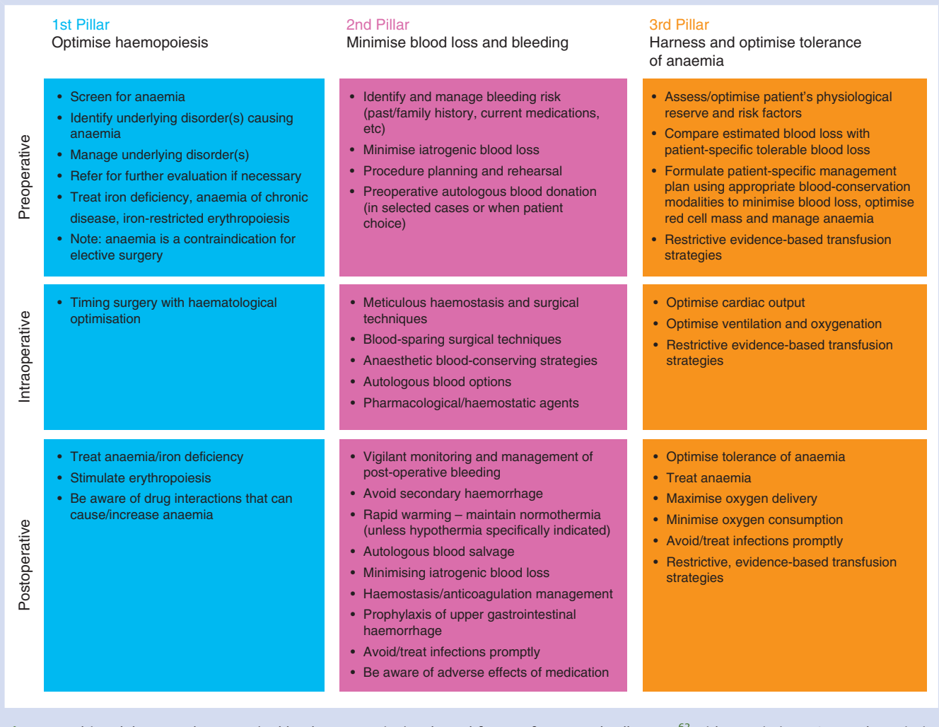
Fig 1 A multimodal approach to PBM (or blood conservation). Adapted from Hofmann and colleagues<sup>62</sup> with permission. ESA, erythropoiesisstimulating agents.